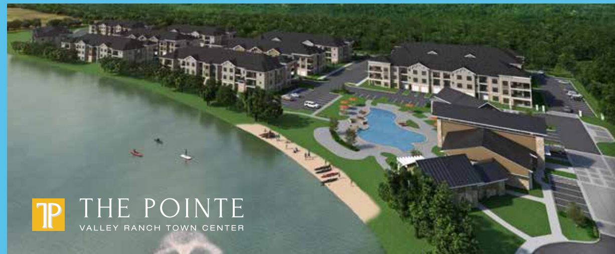
TP THE POINTE VALLEY RANCH TOWN CENTER