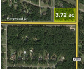
Kingwood Drive & FM 2100 Pad 2 Kingwood Dr & FM 2100 Retail | 3.72 acres