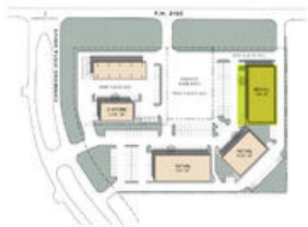
The Commons of Lake Houston Pad 3 FM 2100 Retail | 12,000 sq ft