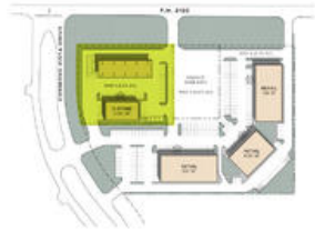
The Commons of Lake Houston Pad 1 FM 2100 Retail | 1.46 acres