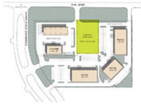
The Commons of Lake Houston Pad 2 FM 2100 Retail | 0.65 acres