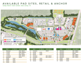
Valley Ranch Town Center Tract 6 Interstate 69 North at Grand Parkway Retail | 8,013 sq ft