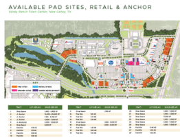
Valley Ranch Town Center Tract 1 Interstate 69 North at Grand Parkway Retail | 4,900 sq ft