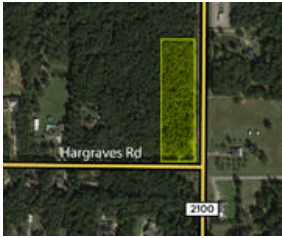
Hargrave Road & FM 2100 Pad 1 Hargrave Rd & FM 2100 Retail | 6.93 acres