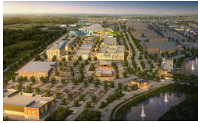
Valley Ranch Entertainment District Interstate 69 North at Grand Parkway Hospitality, Office, Retail | 55 acres