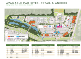
Valley Ranch Town Center Tract 2 Interstate 69 North at Grand Parkway Retail | 65,000 sq ft