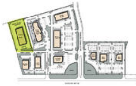
Valley Ranch Crossing Pad 6 Interstate 69 North at Grand Parkway Retail | 1.61 acres