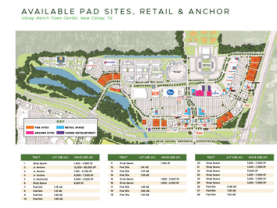
Valley Ranch Town Center Tract 8 Interstate 69 North at Grand Parkway Retail | 1.19 acres