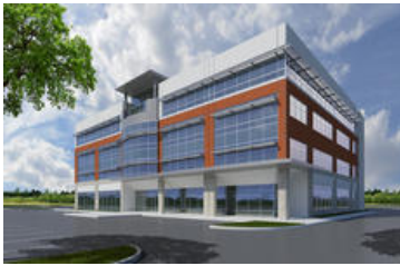
Valley Ranch Place Office Building Interstate 69 North at Grand Parkway Office | 60,000 sq ft