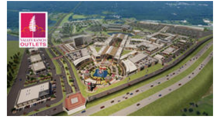
Valley Ranch Outlets Grand Parkway and Interstate 69 Retail | 200,000 sq ft