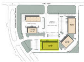
The Commons of Lake Houston Pad 3 FM 2100 Retail | 12,000 sq ft