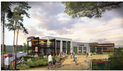
The Boardwalk at Valley Ranch Town Center Interstate 69 North at Grand Parkway Retail | 21,000 sq ft