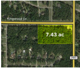
Kingwood Drive & FM 2100 Pad 1 Kingwood Dr & FM 2100 Retail | 7.43 acres