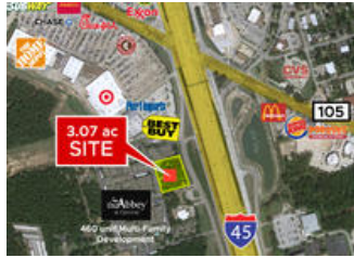
I-45 Conroe Pad 1 I-45 & Hwy 105 Retail | 3.07 acres