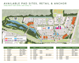
Valley Ranch Town Center Tract 7 Interstate 69 North at Grand Parkway Retail | 1.76 acres