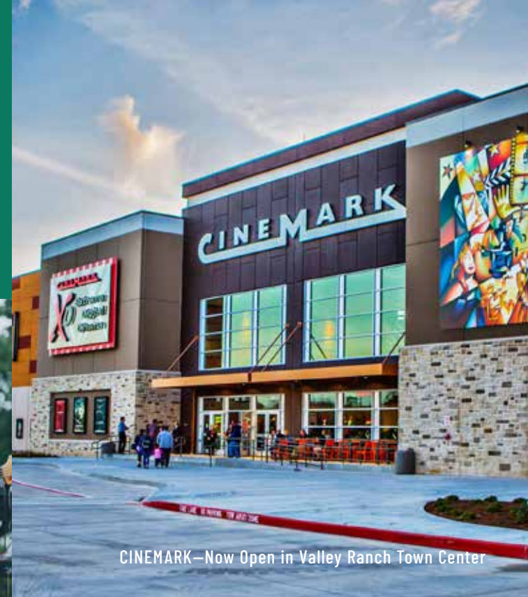
CINEMARK—Now Open in Valley Ranch Town Center