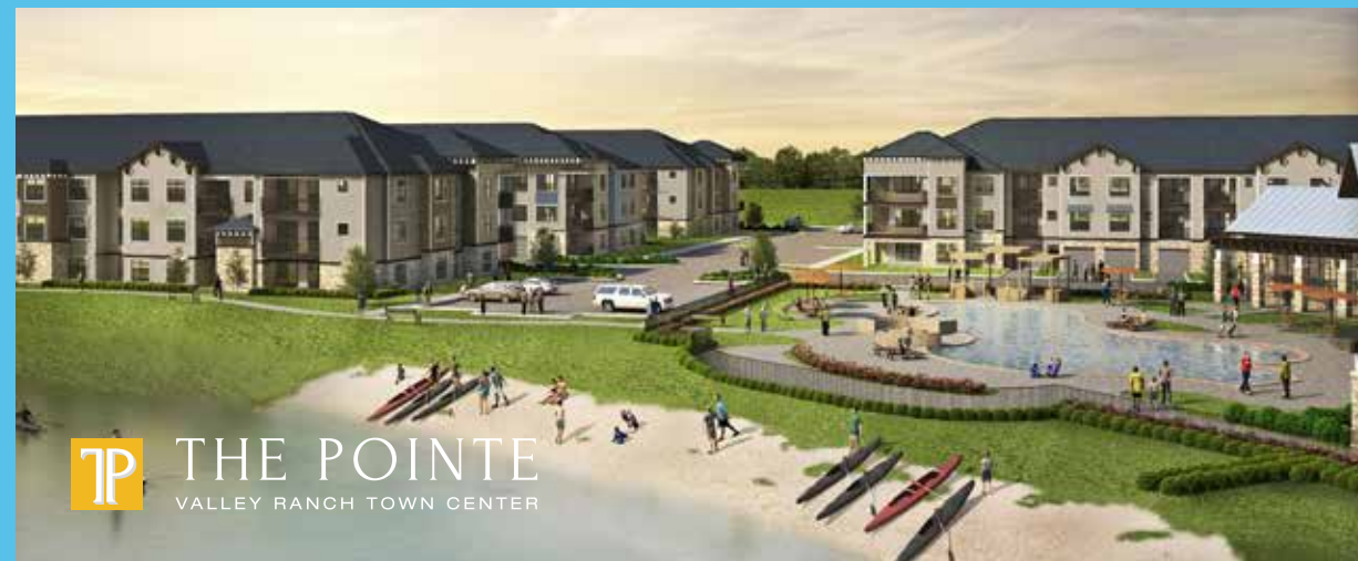
TP THE POINTE VALLEY RANCH TOWN CENTER